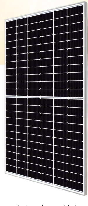
*Black frame product can be provided upon request.

Heavy snow load up to 5400 Pa, enhanced wind load up to 2400 Pa*