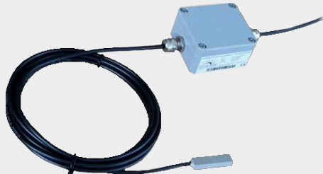
Module Temperature sensor