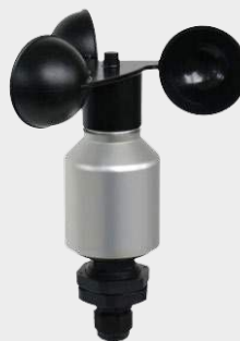
Wind Velocity sensor