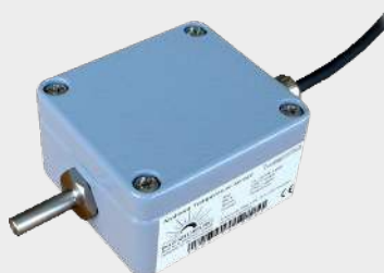
Ambient Temperature sensor